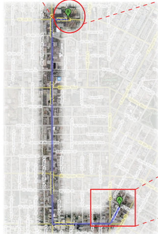
Typical 6-minute drive to supermarket in LA