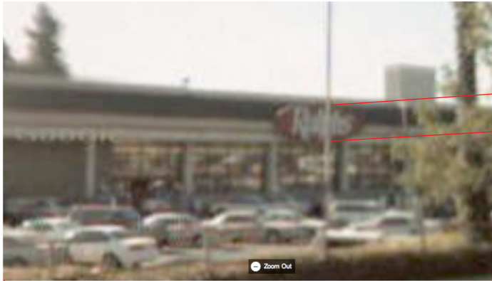
Original location: Ralph's supermarket